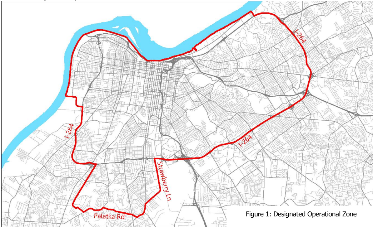
Figure 1: Designated Operational Zone

The designated operation zone is shown in red below: